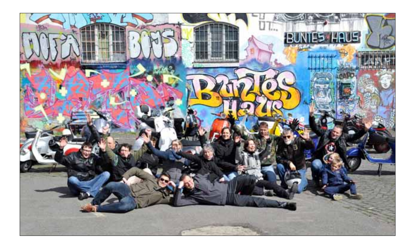
▲ Members of the Vespa Club Celle enjoying the calm before the storm ▼