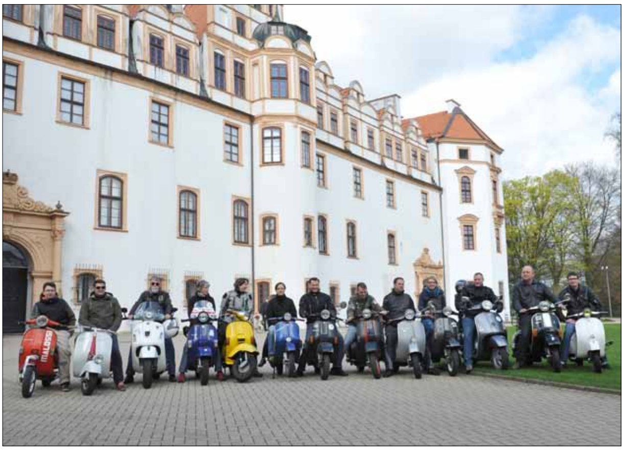
▲ Members of the Vespa Club Celle (VCC) in front of the ducal castle, former home of the Braunschweig-Lüneburg family.

A rough guide to the "Vespa Village. Note: the yellow and green areas are not part of the "Vespa Village".